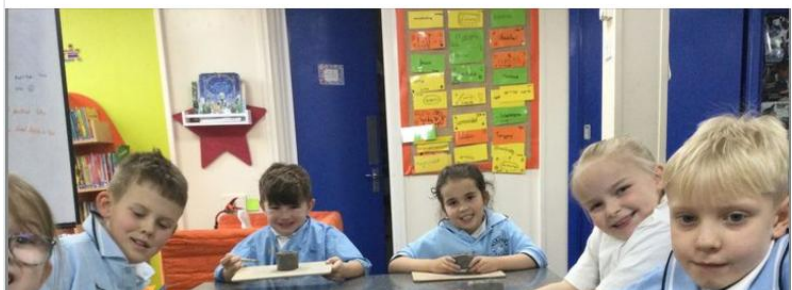
Year 3 making clay pots in the style of the artist 'Clarice Cliff'