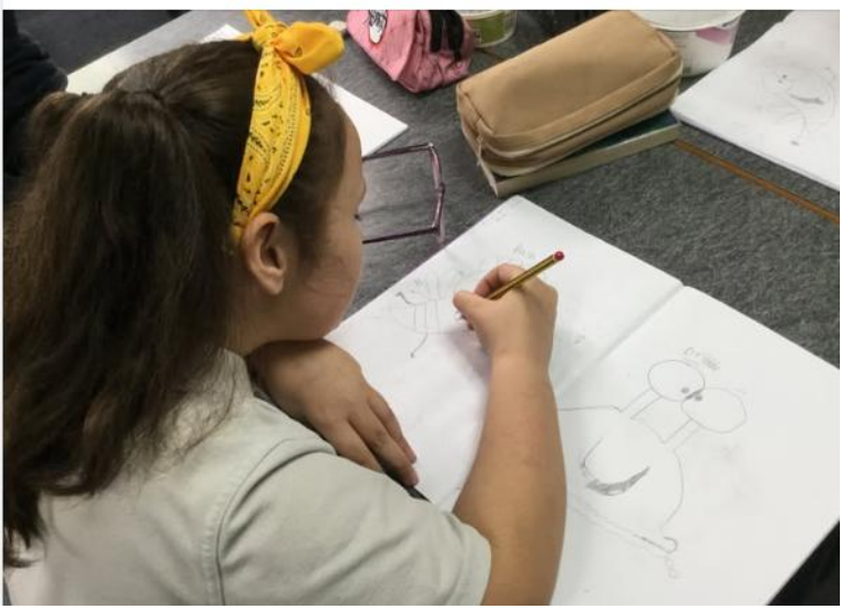
Year 5 had a fantastic time in History yesterday, taking part in a Viking-themed dragons den! Their clans had to come up with a trade proposal that they had to sell to three 'dragons' in the hopes of getting an investment, showcasing their knowledge of trade during that time period.