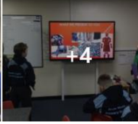
Year 2 have been very creative today, using a variety of tools to create different marks in their expressive painting unit.